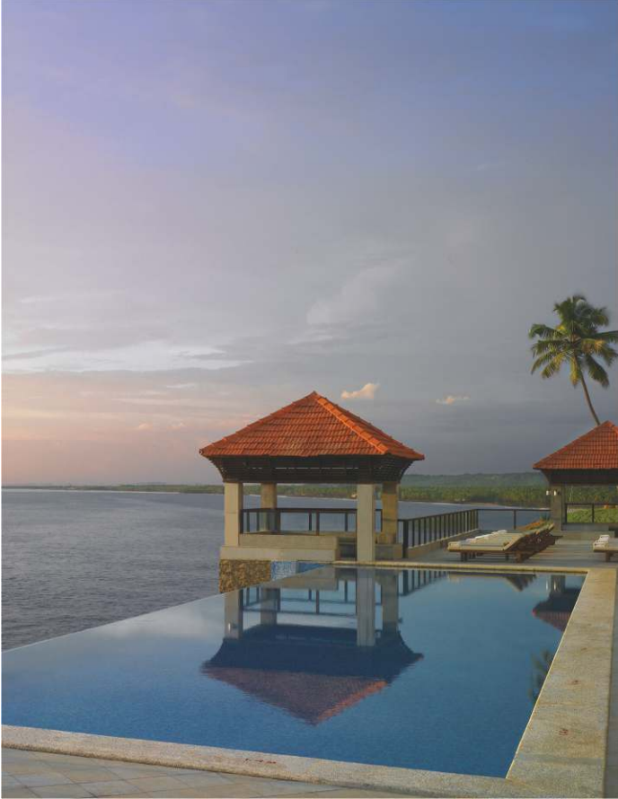
Infinity Pool at The Club