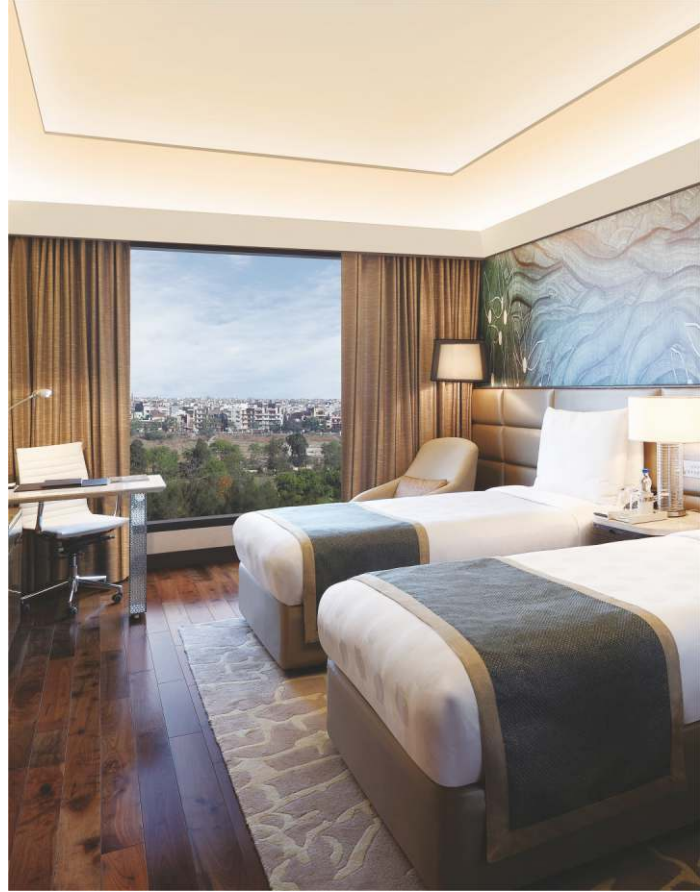
Premier Twin Room