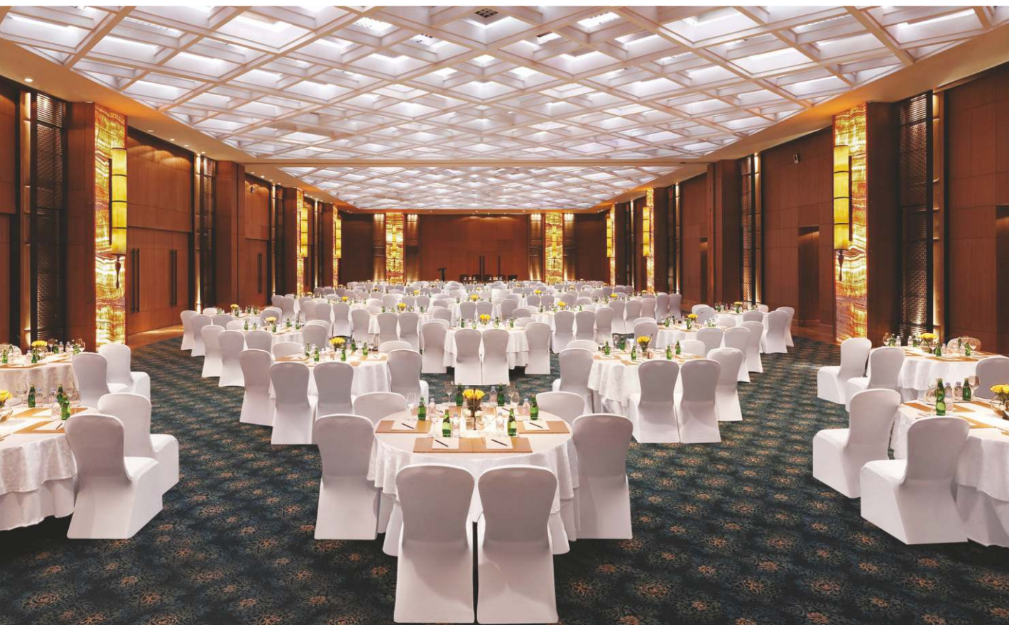
Grand Sapphire Ballroom