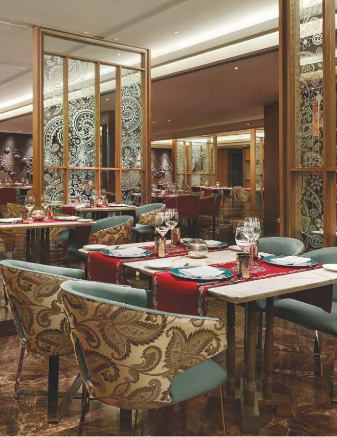
Dilli 32 - Indian Fine Dine Restaurant