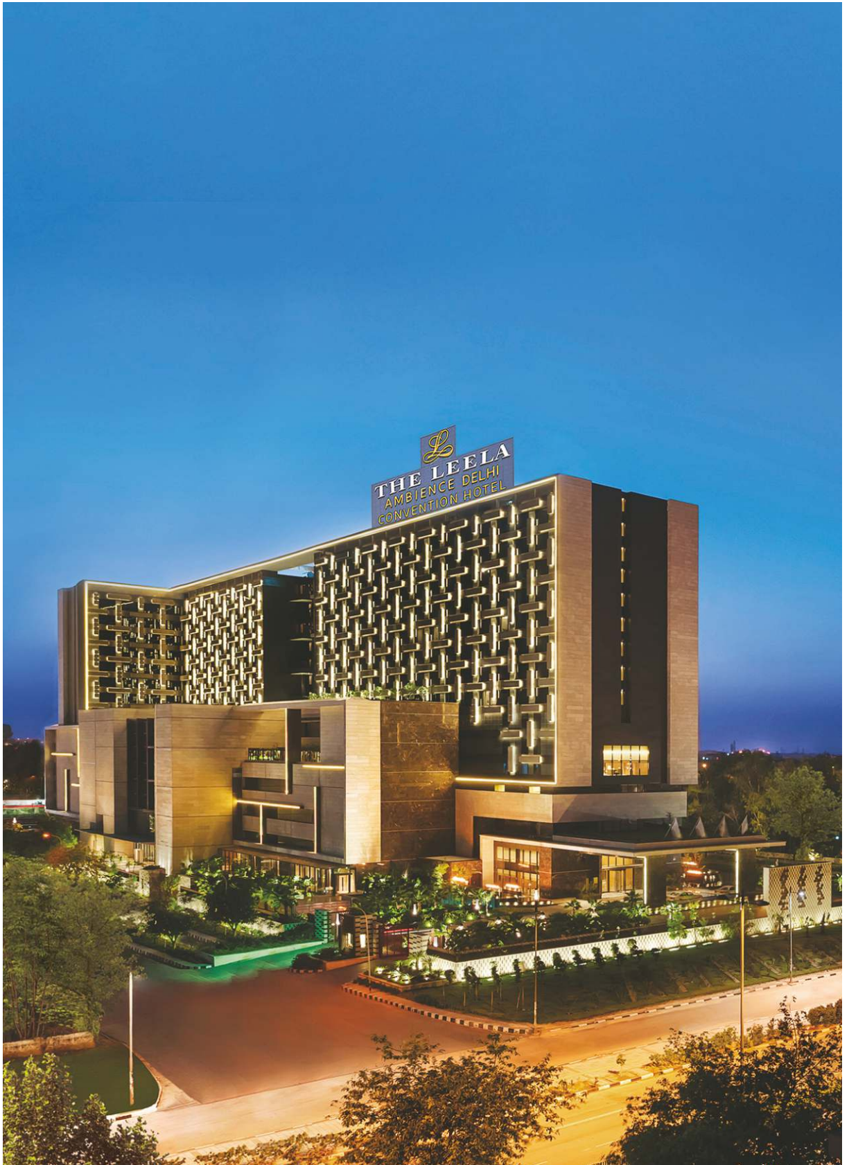
The Leela Ambience Convention Hotel Delhi