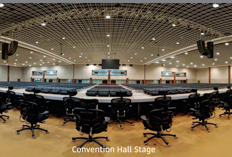
Convention Hall Stage