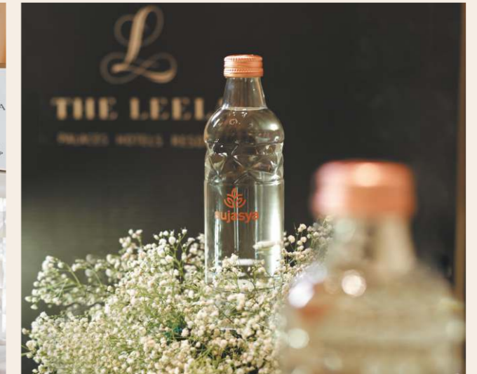
Aujasya by The Leela Water Bottles