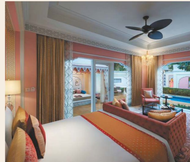
Royal Villa with Plunge Pool, The Leela Palace Jaipur