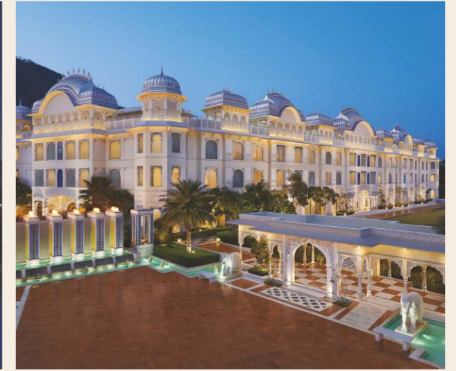
The Leela Palace Jaipur