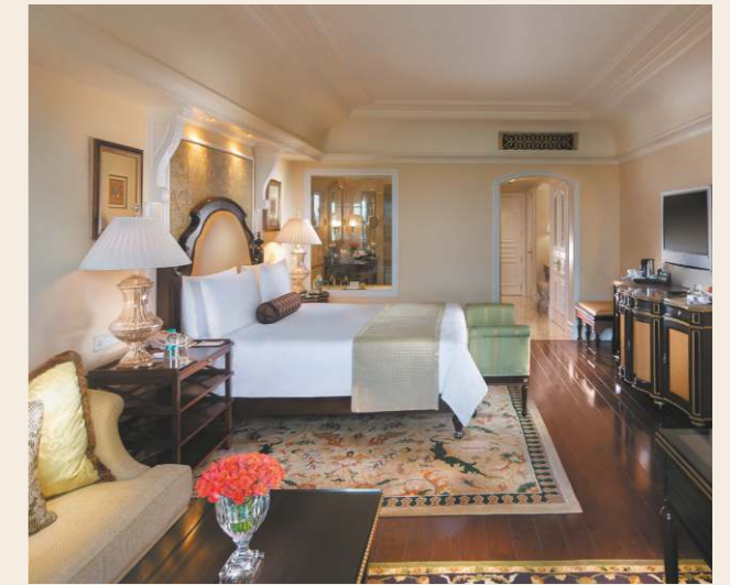
Royal Club Room, The Leela Palace Bengaluru