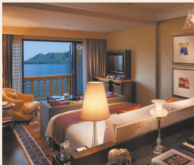
Grand Heritage Lake View Room, The Leela Palace Udaipur