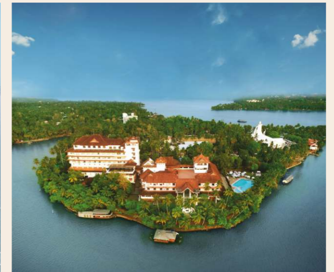
The Leela Ashtamudi, A Raviz Hotel