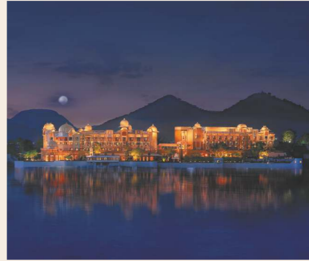
The Leela Palace Udaipur