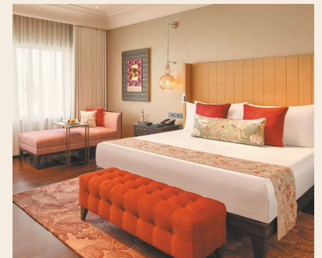
The Florentine, The Leela Hyderabad