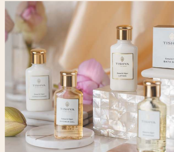
Tishya by The Leela Bath Amenities