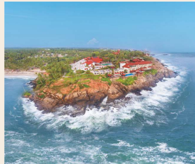
The Leela Kovalam, A Raviz Hotel