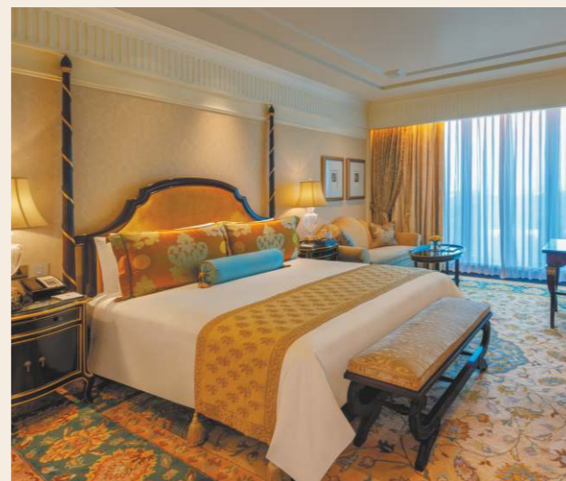
Royal Premiere Room, The Leela Palace New Delhi