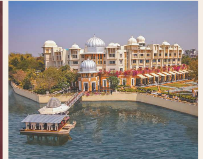
EV Boats, The Leela Palace Udaipur