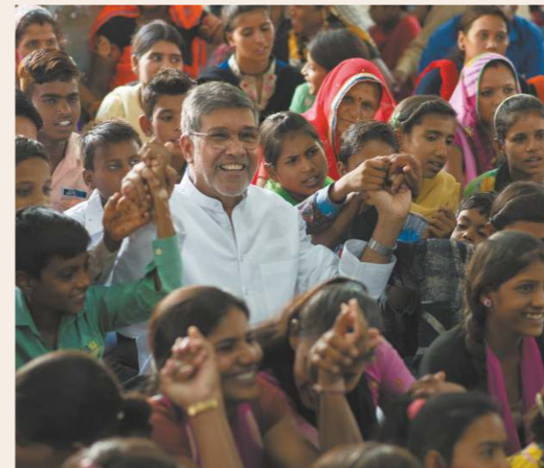
Kailash Satyarthi Children's Foundation