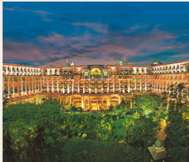
The Leela Palace Bengaluru