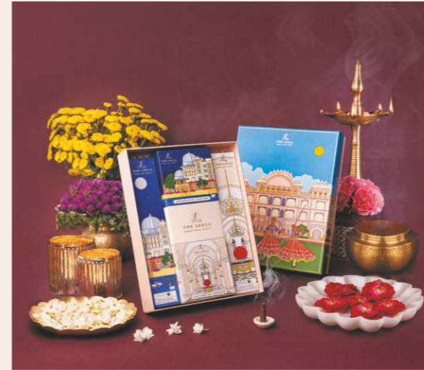
Leela Ke Phool