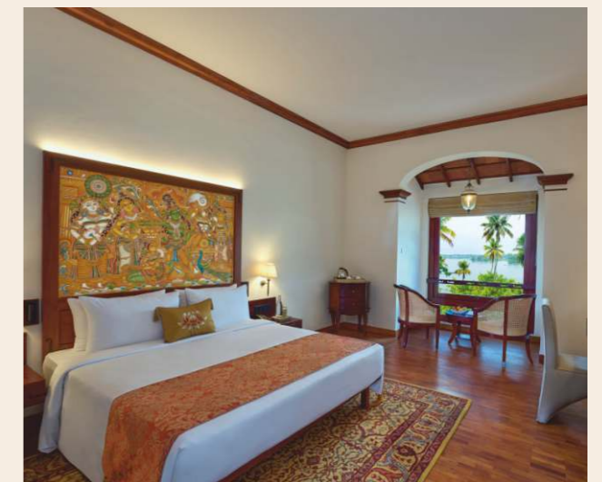
Royal Premier, The Leela Ashtamudi, A Raviz Hotel