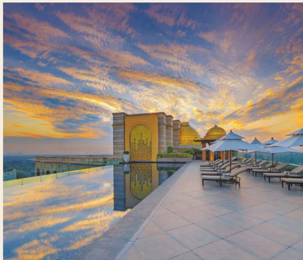
The Leela Palace New Delhi