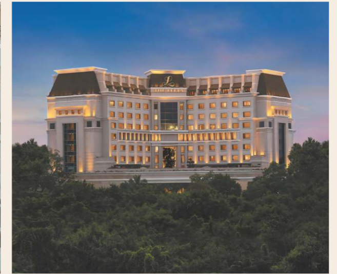
The Leela Hyderabad