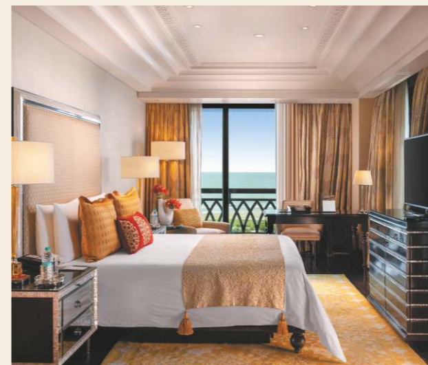
Royal Club Sea View Room, The Leela Palace Chennai