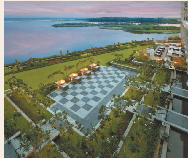
The Leela Palace Chennai