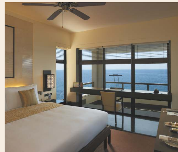
Royal Club Suite, The Leela Kovalam, A Raviz Hotel