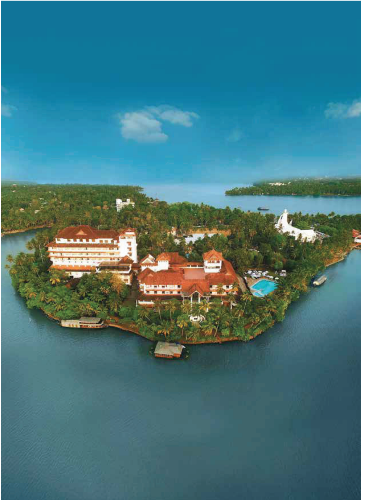
The Leela Ashtamudi, A Raviz Hotel