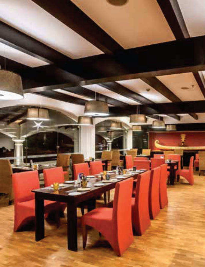
Keraleeyam - All-Day dining