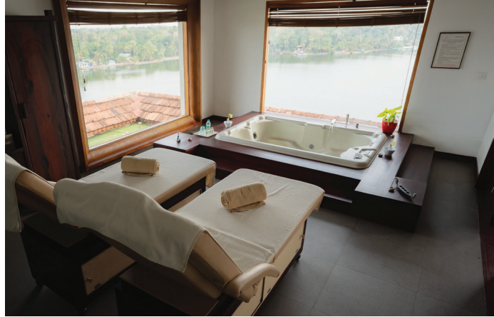
Favourite Kerala Ayurveda & Spa