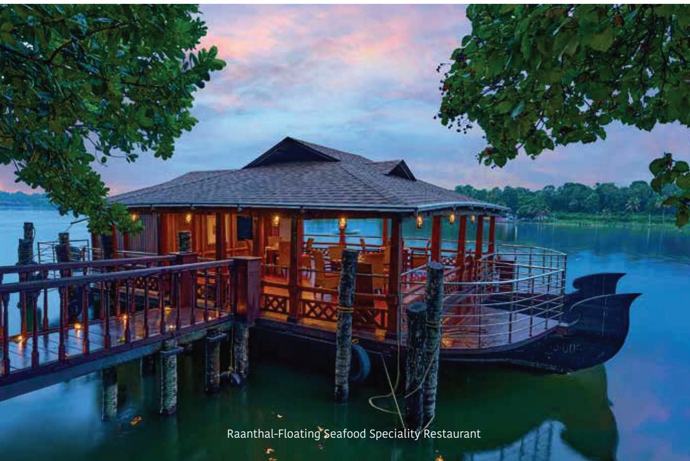
Raanthal-Floating Seafood Speciality Restaurant