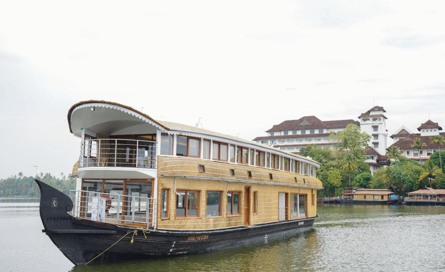
The Raviz Floating Fort