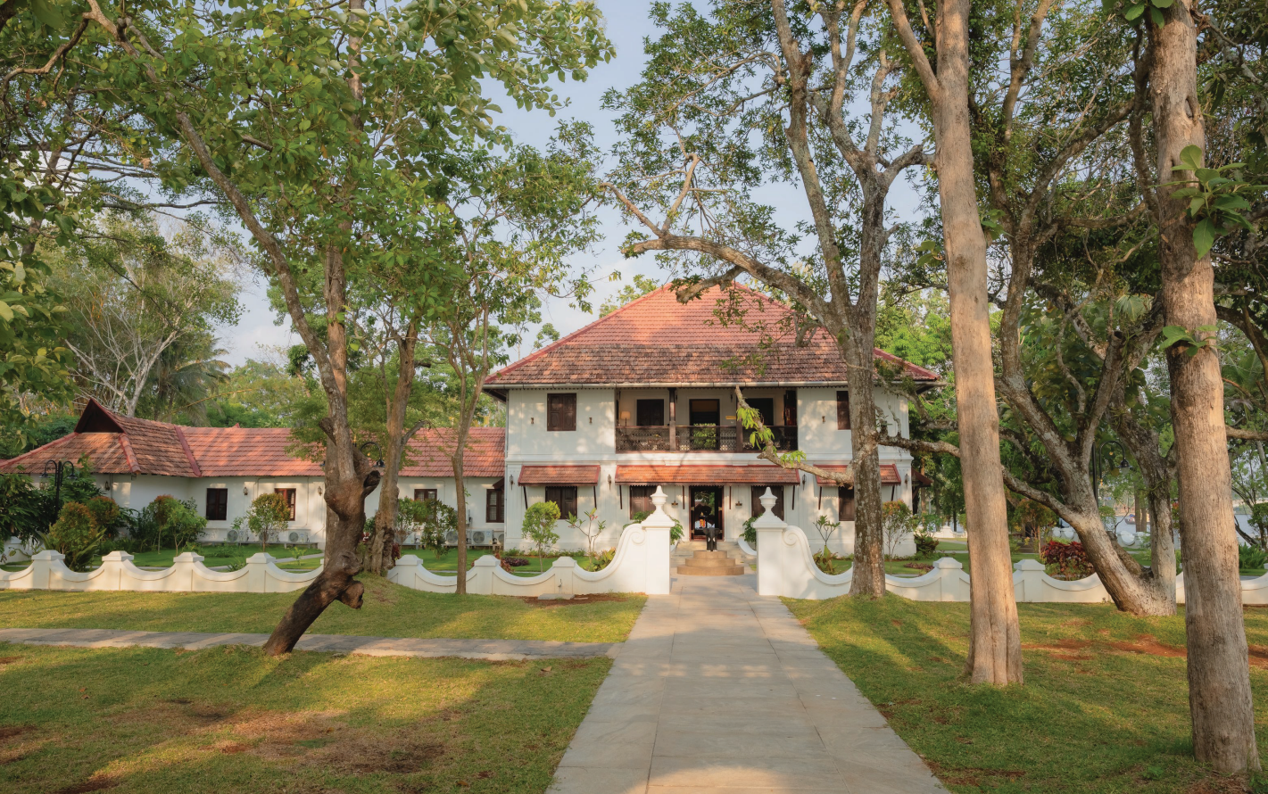
The Raviz Palace