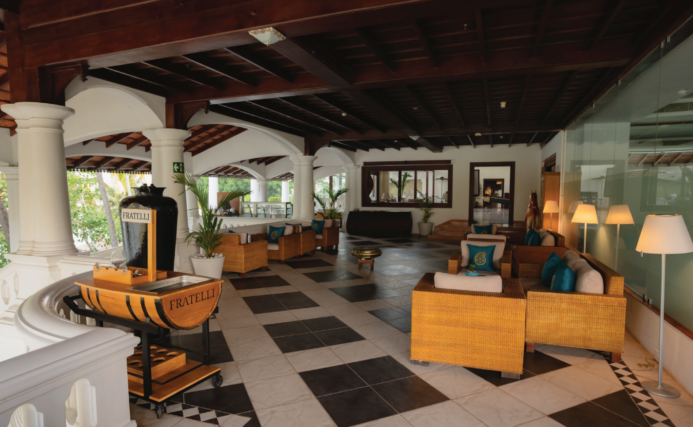
The Portico Cafe