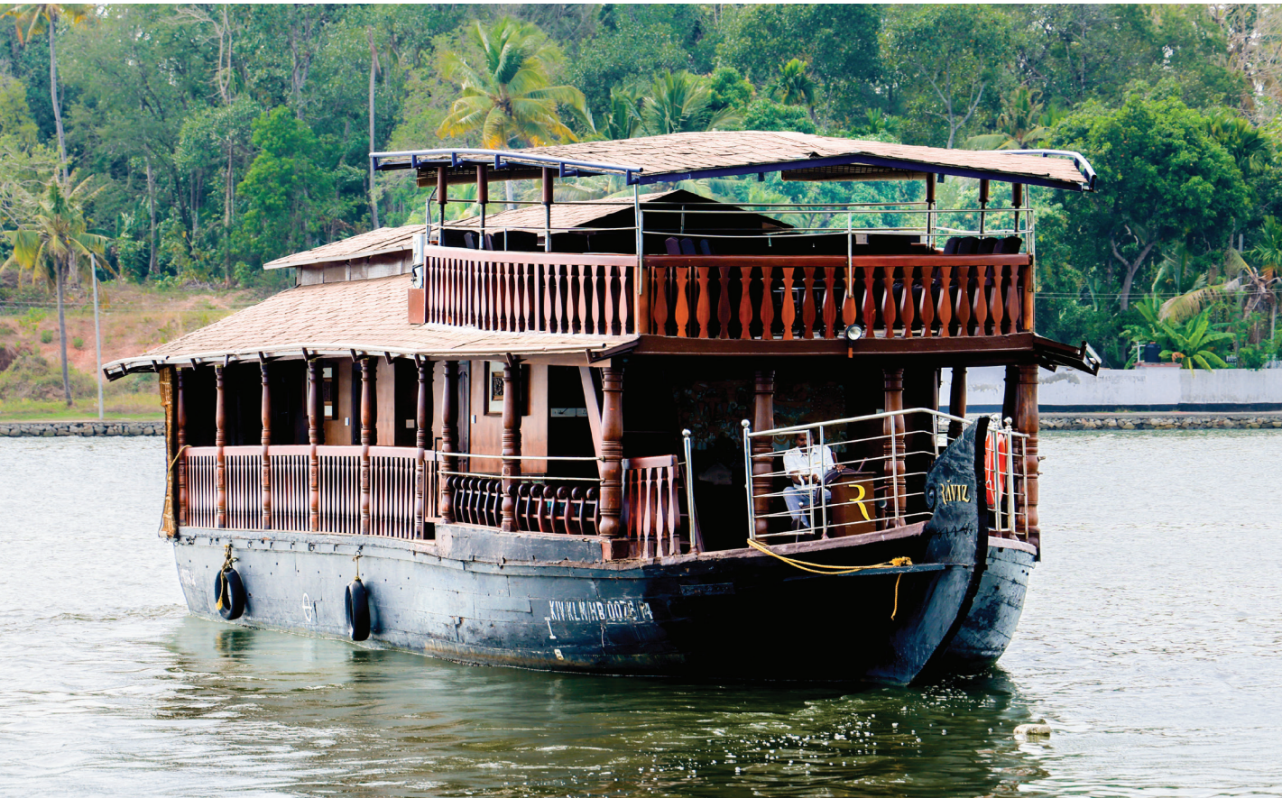
Mahayana - The Houseboat