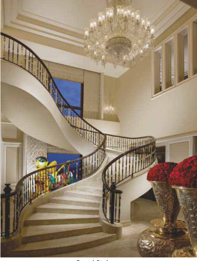
Grand Ballroom Grand Staircase