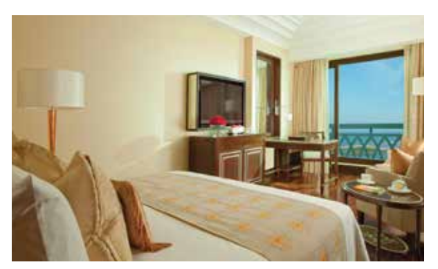
Deluxe Guest Sea View