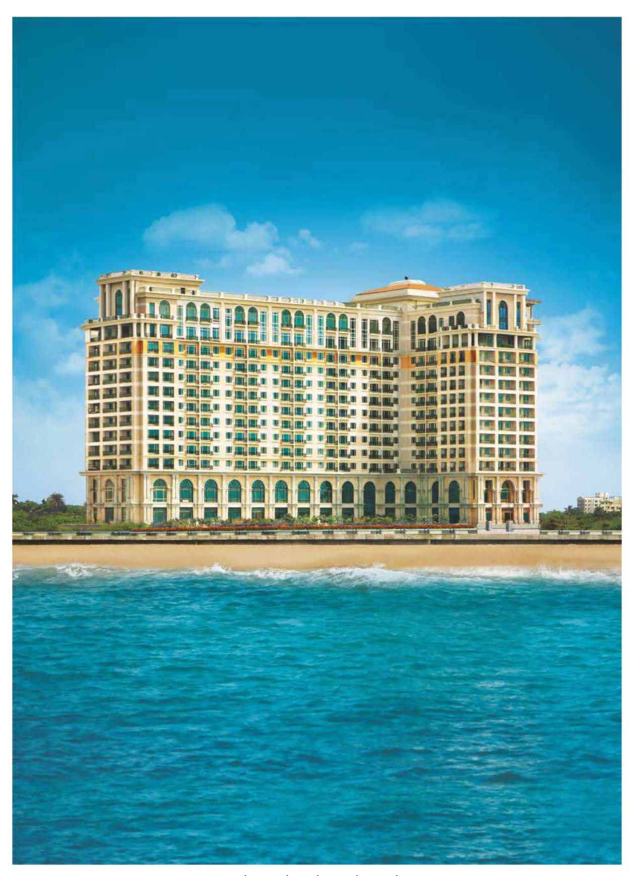
The Leela Palace Chennai