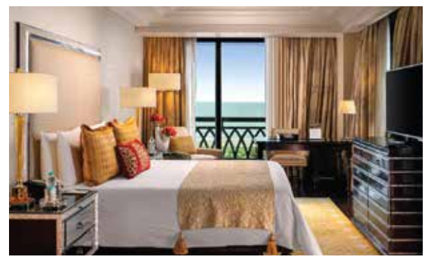
Premium Sea View