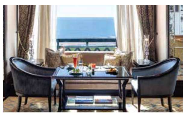
Royal Club Room