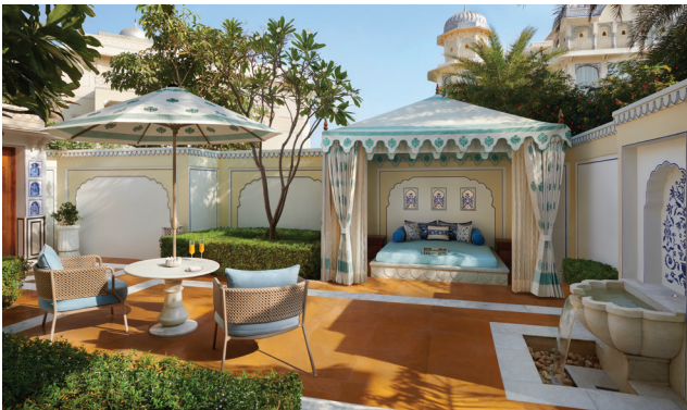
Royal villa with courtyard