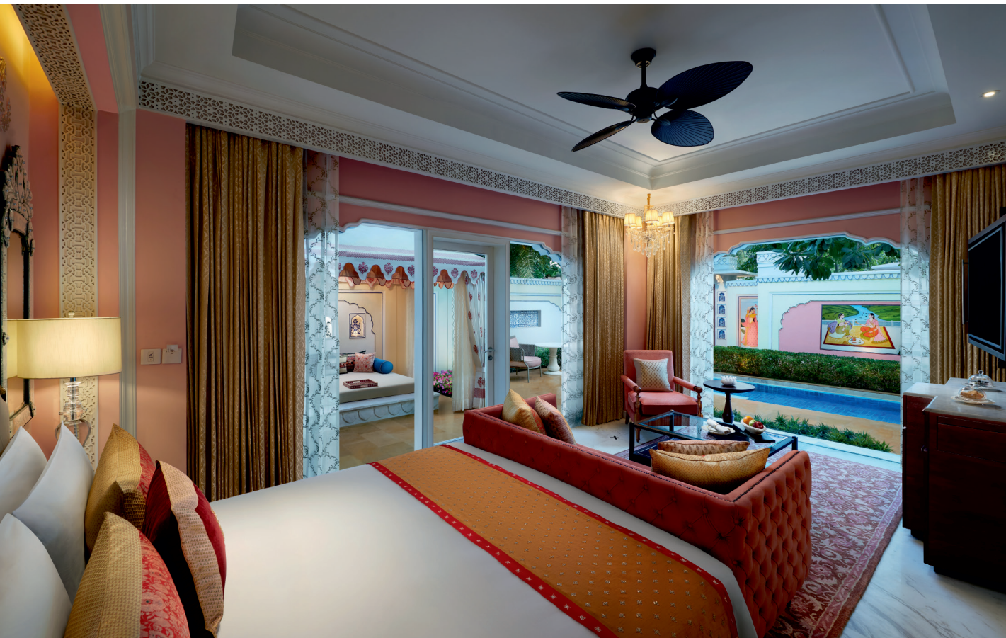
Royal Villa with Plunge Pool