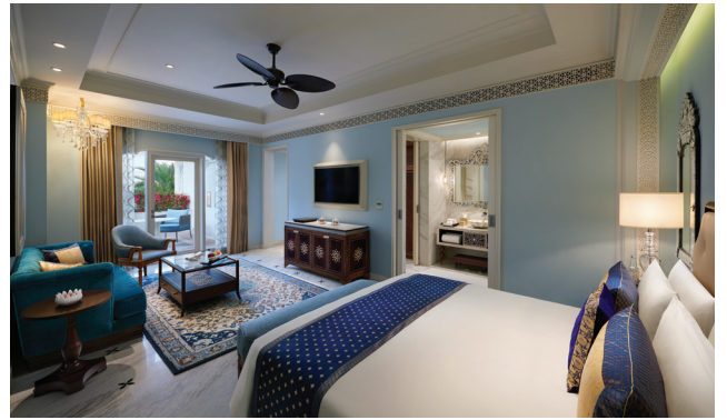
Grand villa with terrace