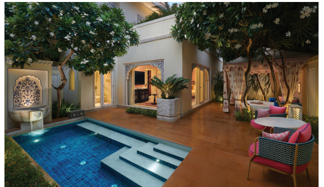
Royal villa with plunge pool