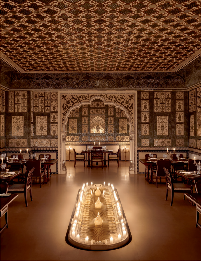
Mohan Mahal - Indian Speciality restaurant