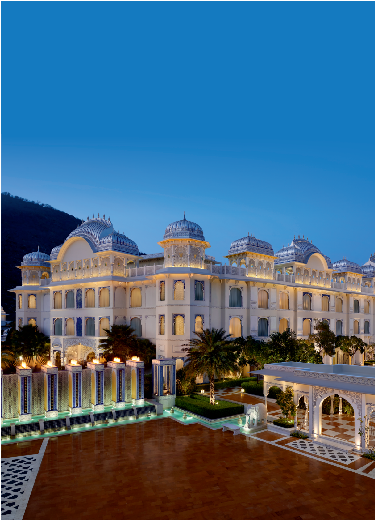
The Leela Palace Jaipur