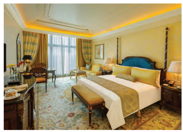
Royal Club Room