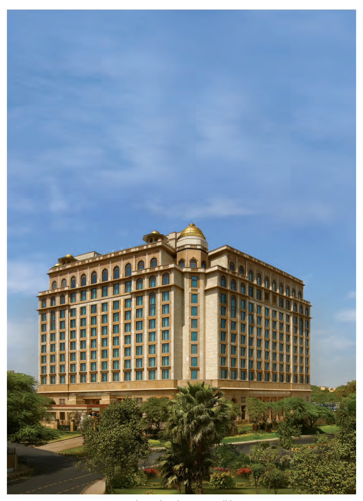
The Leela Palace New Delhi