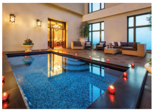
Royal Suite with Pool