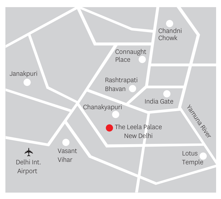
Transportation: International Airport, 15 km, Domestic Airport, 13 km