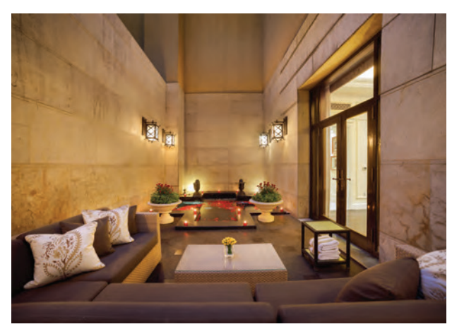
Grand Suite with Pool