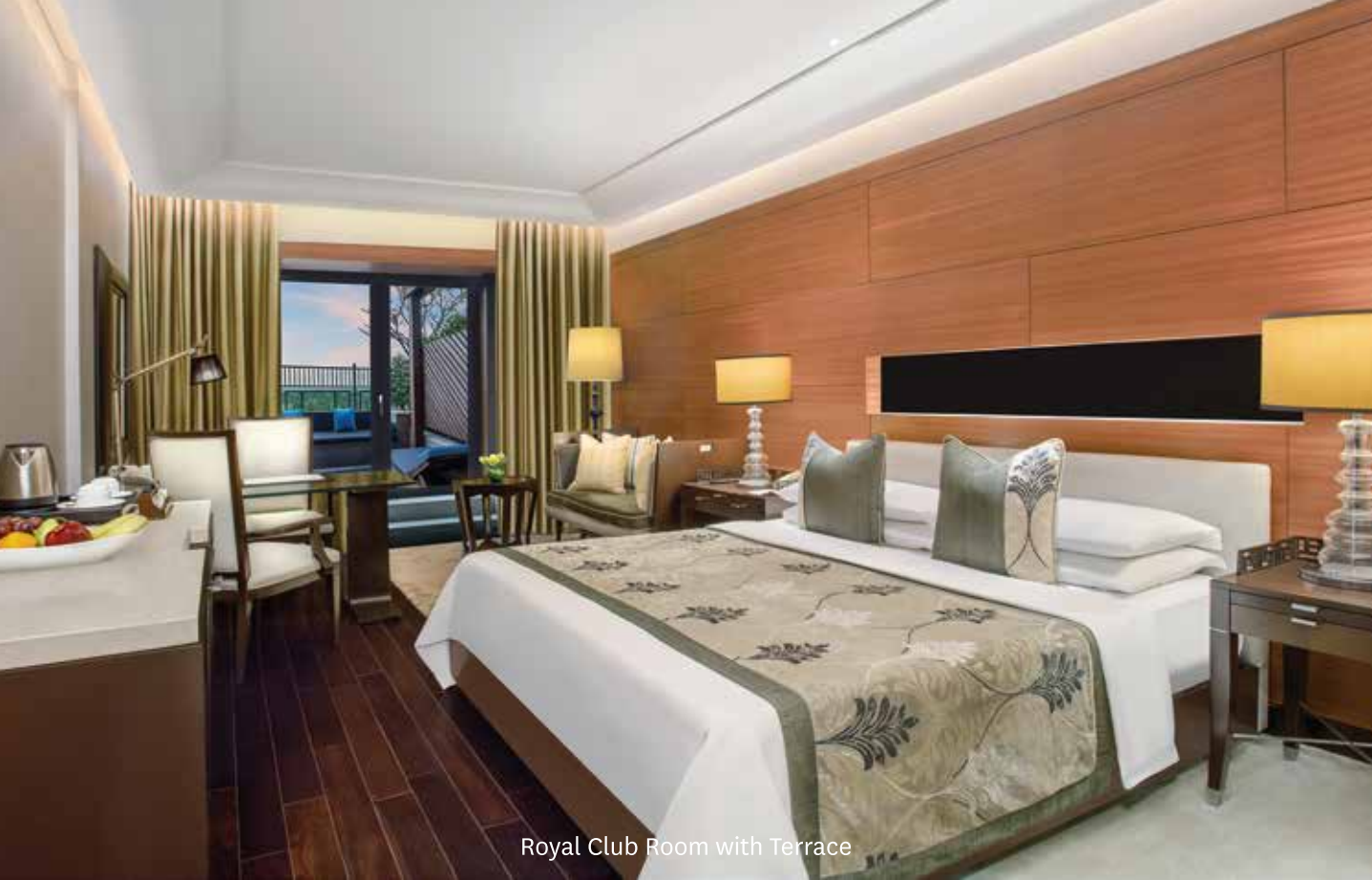
Royal Club Room with Terrace