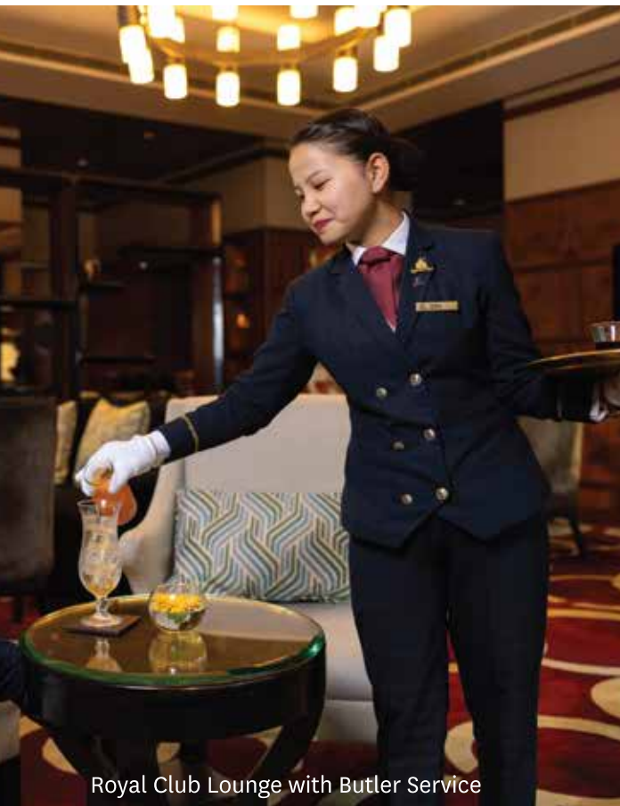
Royal Club Lounge with Butler Service