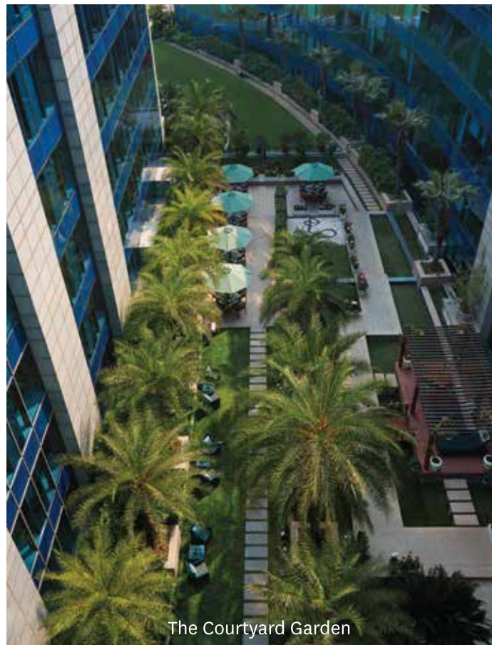
The Courtyard Garden