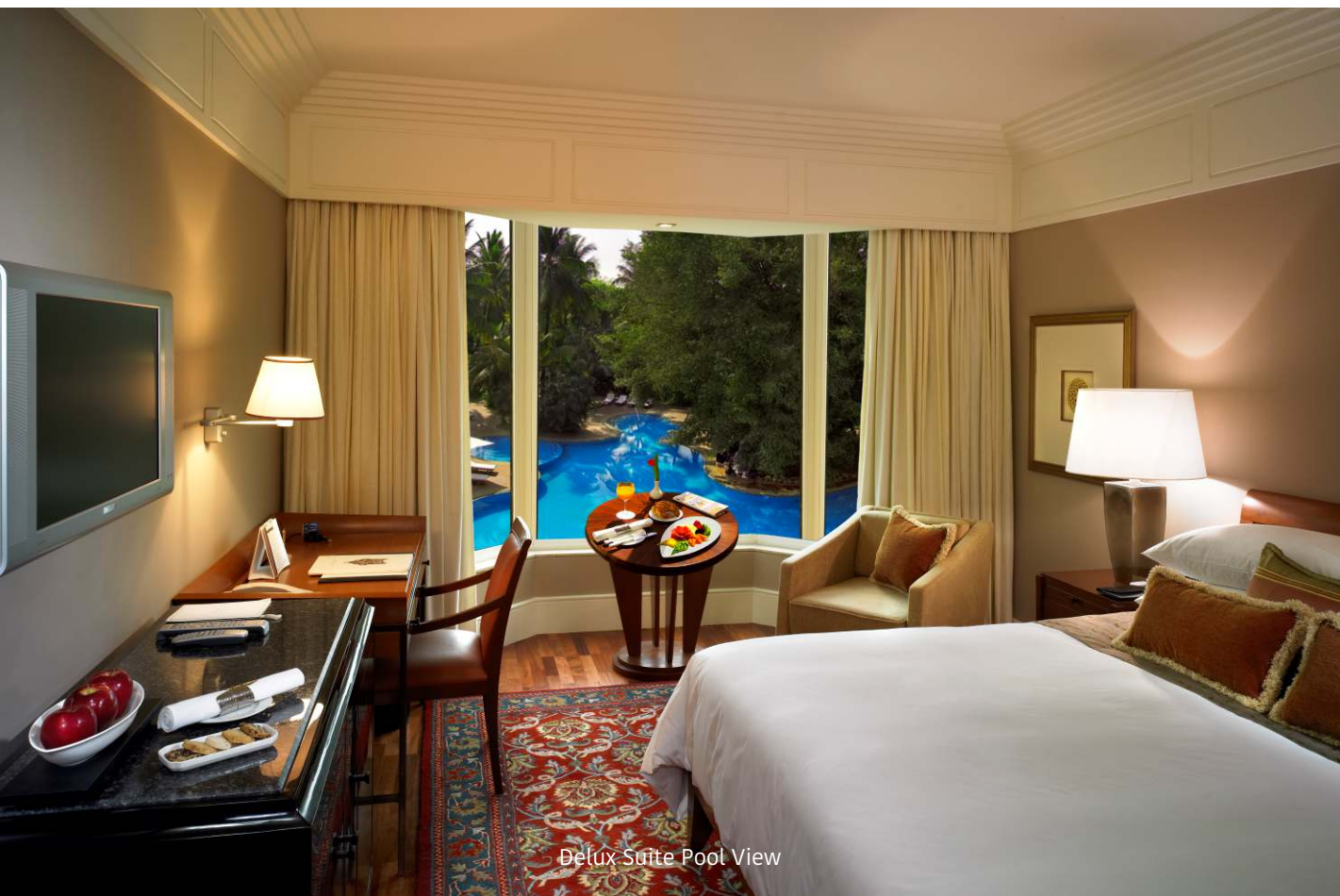
Delux Suite Pool View