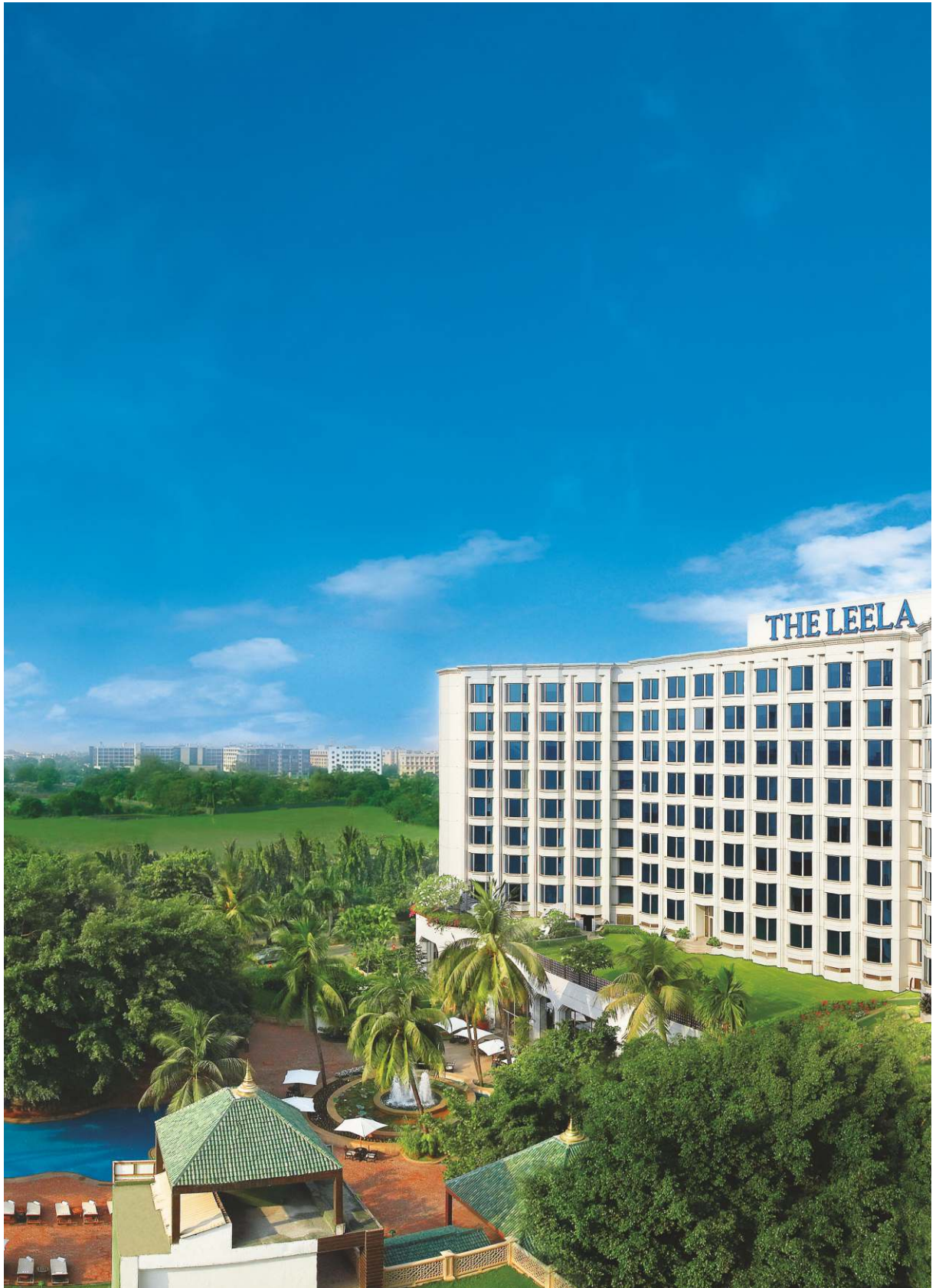
The Leela Mumbai