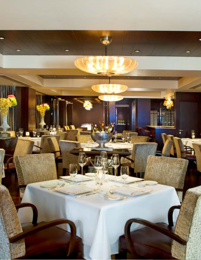
Le Cirque Signature