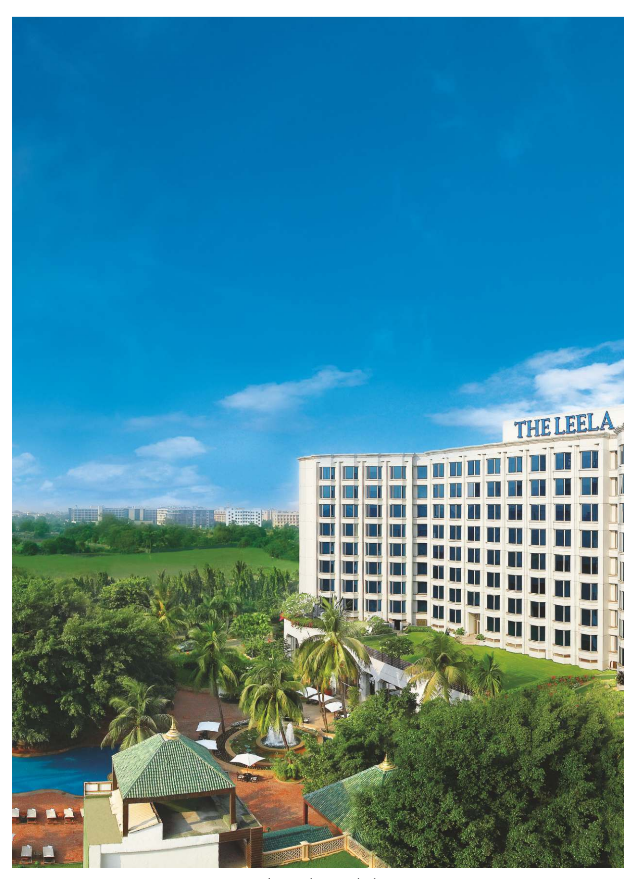
The Leela Mumbai