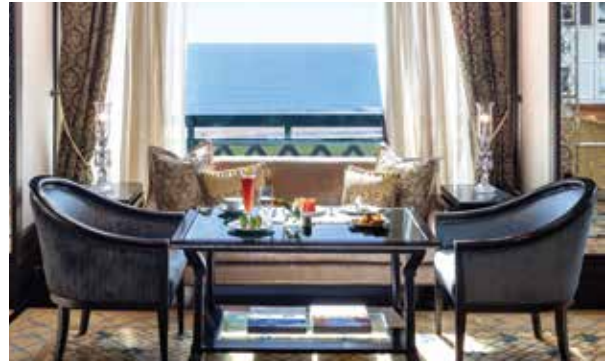
Royal Club Room