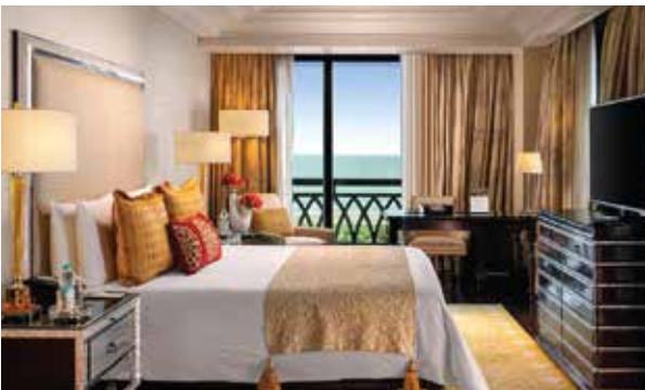
Premium Sea View