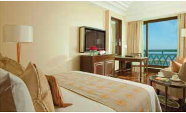
Deluxe Guest Sea View