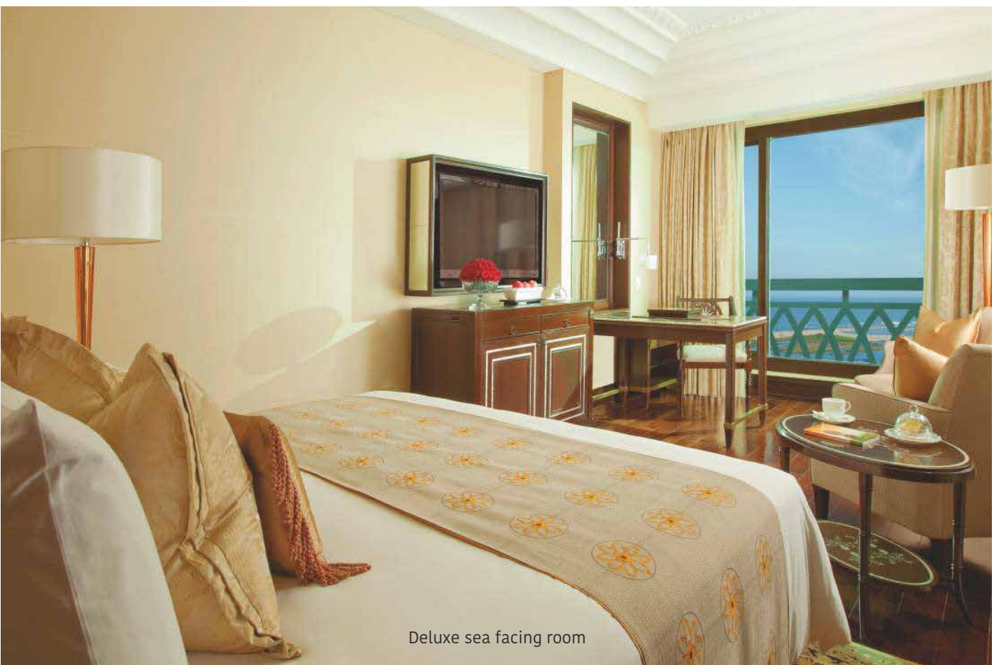
Deluxe sea facing room