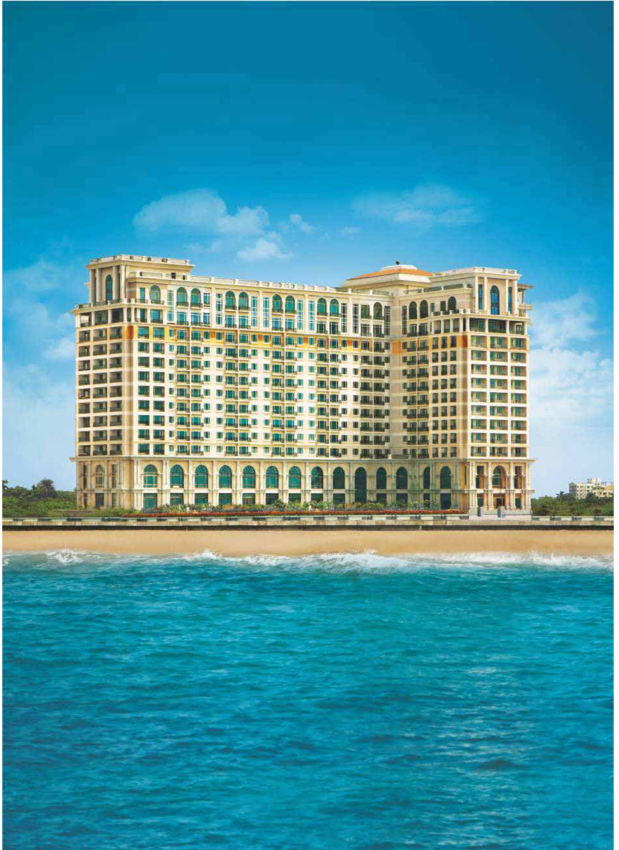
The Leela Palace Chennai