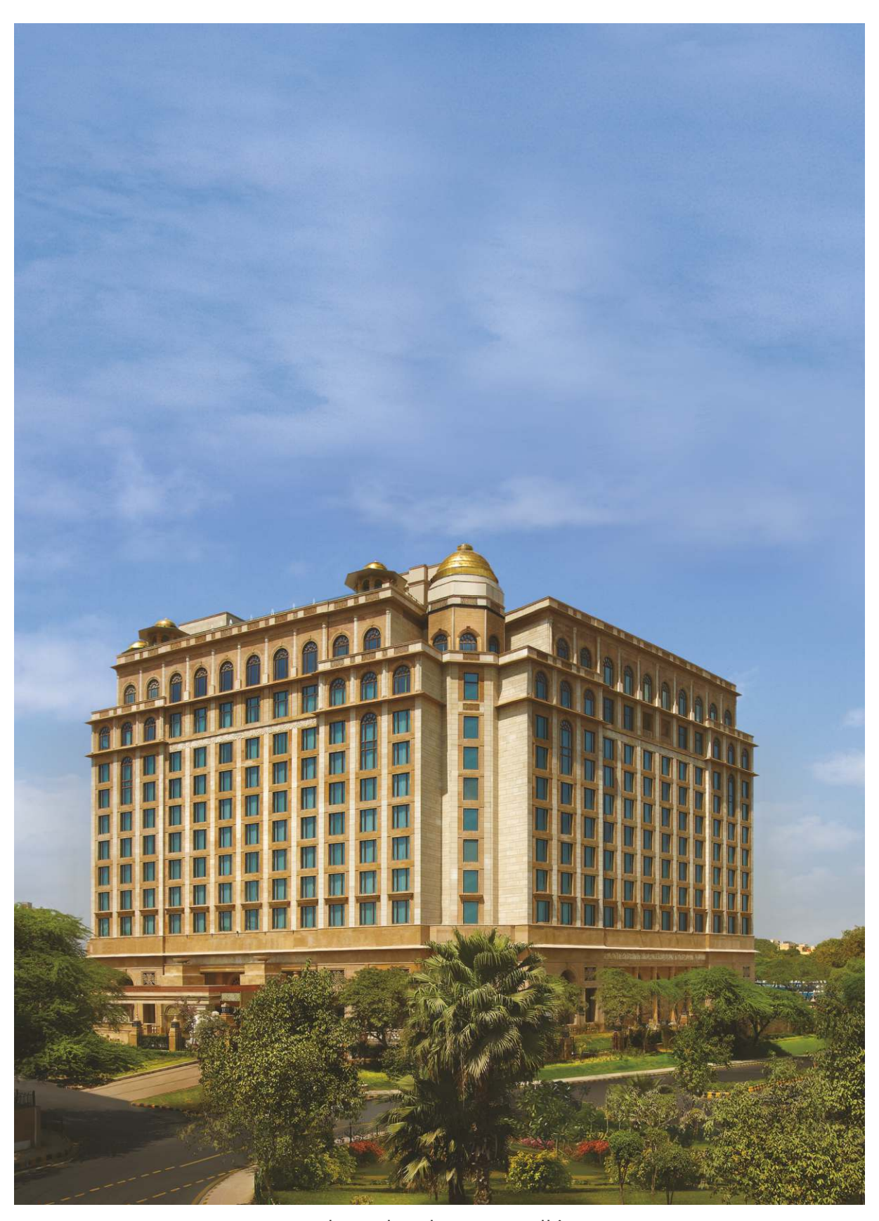
The Leela Palace New Delhi