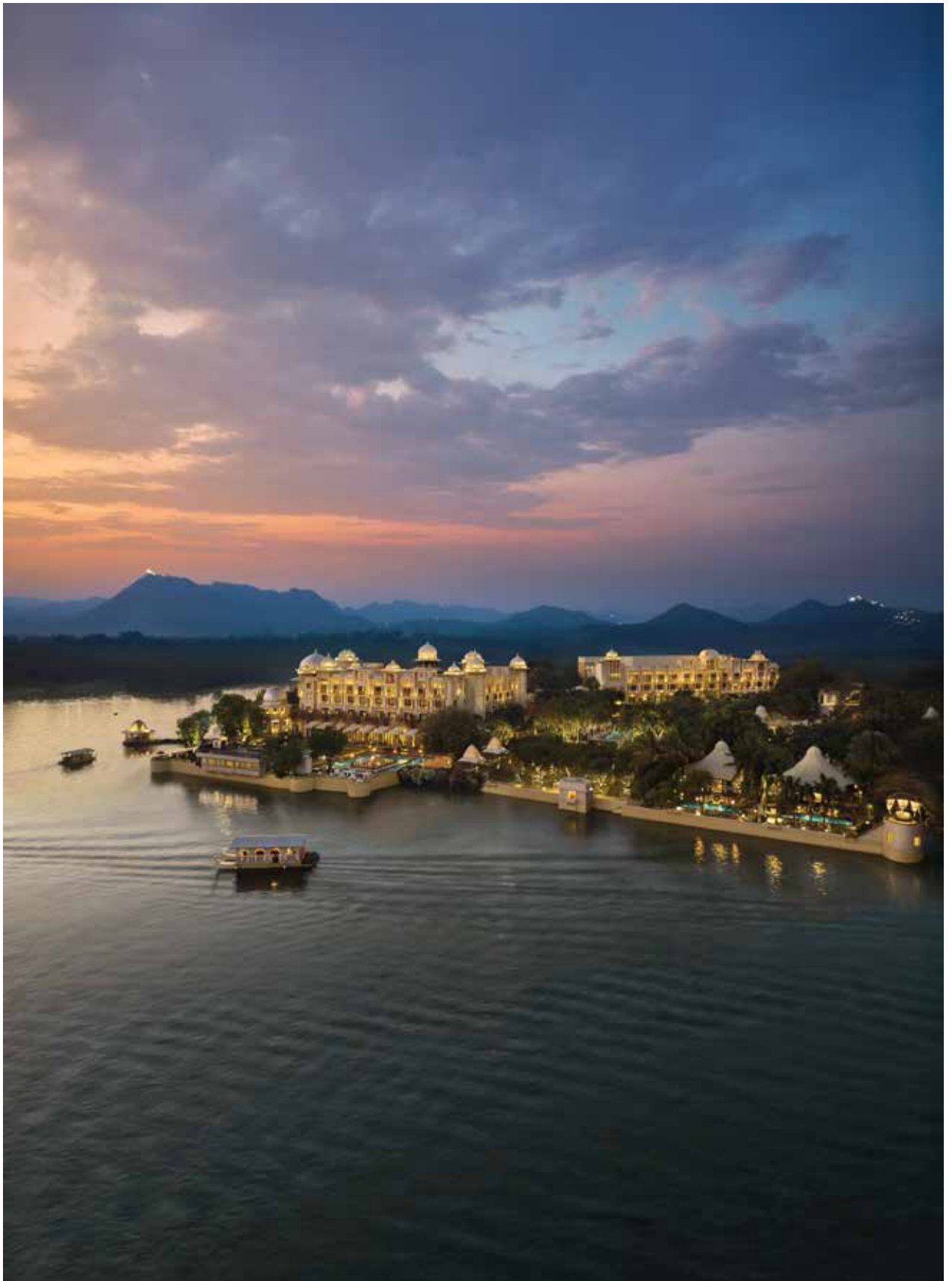
The Leela Palace Udaipur