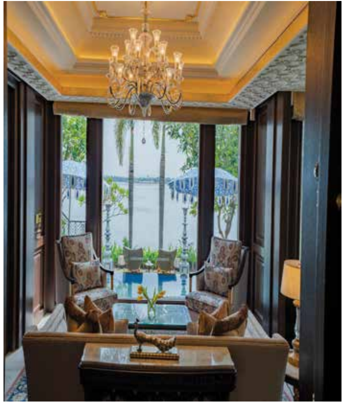
Arq at Pichola